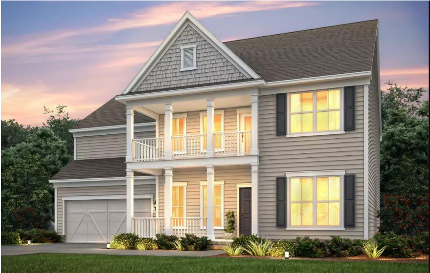
Neighbor on left: 123 Main Street