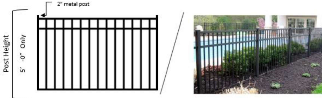
Straight Topped Wrought Iron or Aluminum Fence